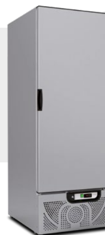
CHEF 600 PX