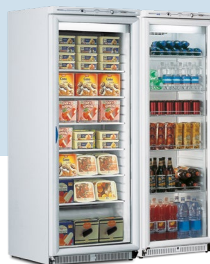
ICE PLUS N60 + BEV

✓ Rispetto ambientale: Gas R290 Environmentally friendly: R290 Gas