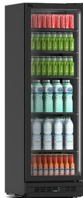
ACQUA P 400 B